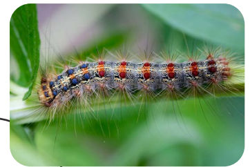
April – June Larvae (Caterpillars)