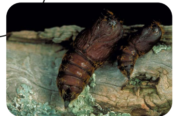
June – July Pupae