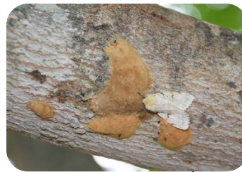
July – April Eggs

Adult males: Greyish-brown with dark markings and can fly and survive about one week, mating with several different females.