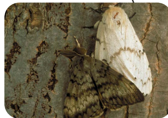
July – August Adult Moths